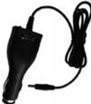
E) 12-15V DC CAR CHARGER