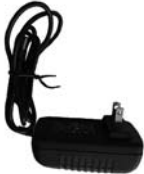
B) 100-240V AC/15V CHARGER