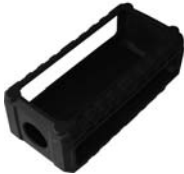
G) RUBBER COATING