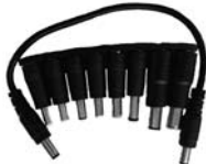
D) MULTI-VOLT DIGITAL CONNECTORS