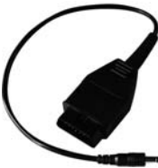
F) OBDII CABLE