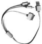
C) USB MULTI-CONNECTOR