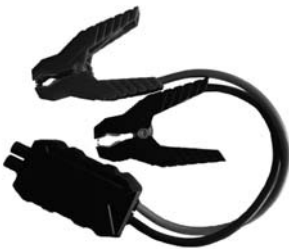
A) SMART CABLES